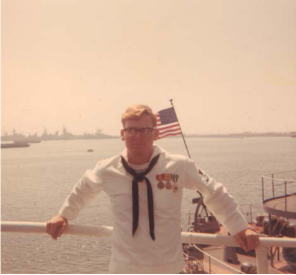
Okie on the Tolovana ~ 1964