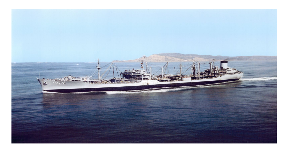
USS Tolovana AO-64 Reunion Sept 18–21, 2023 Branson Missouri

Some of us arrived Monday at the Comfort Inn at Thousand Hills in Branson, Missouri. The hotel was very nice with great staff. We had a very nice conference room with a refrigerator, projector and screen for our meet and greet. We ordered out for fried chicken and catfish which was hot and juicy from the Chicken House.