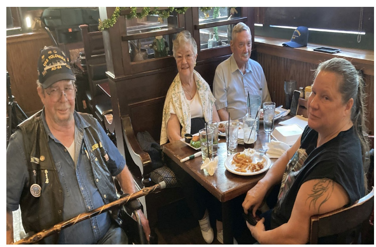
Chowing down at Waxy O'Shea's Irish Pub at the Landing

After the meeting Thursday, we went to the Brandon Landing and took in the shops and restaurants. Most of us went to Waxy O'Shea's Irish Pub and others went to local shows, of which there are a ton.