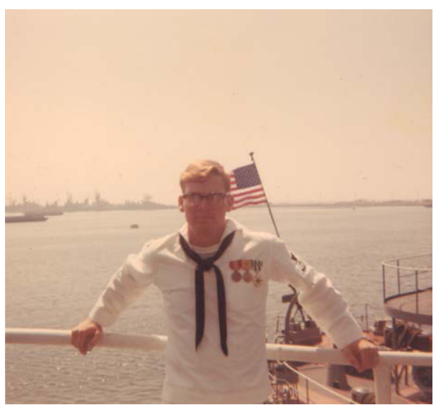
Okie on the Tolovana ~ 1964