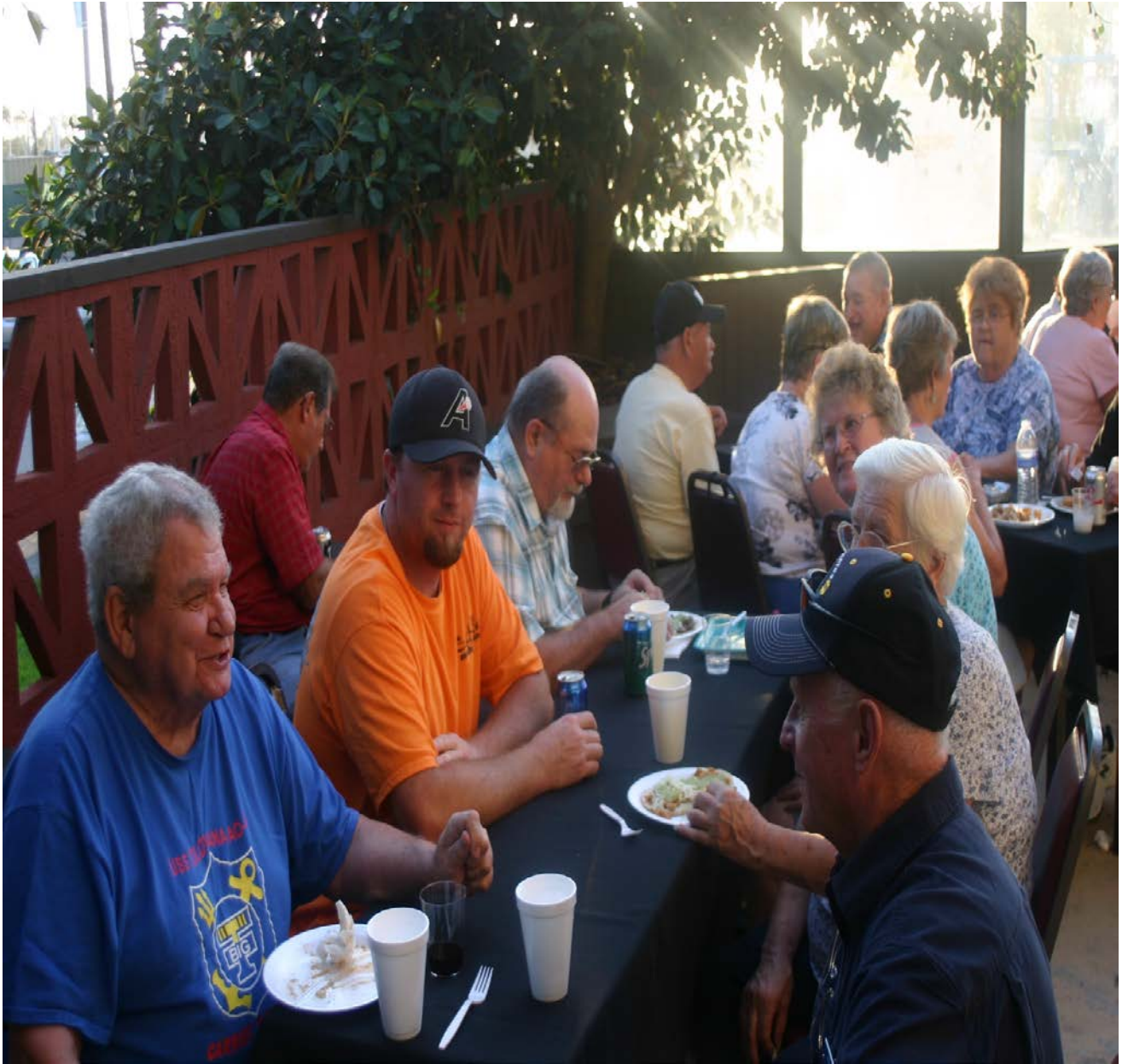
2016 Long beach reunion Taco dinner