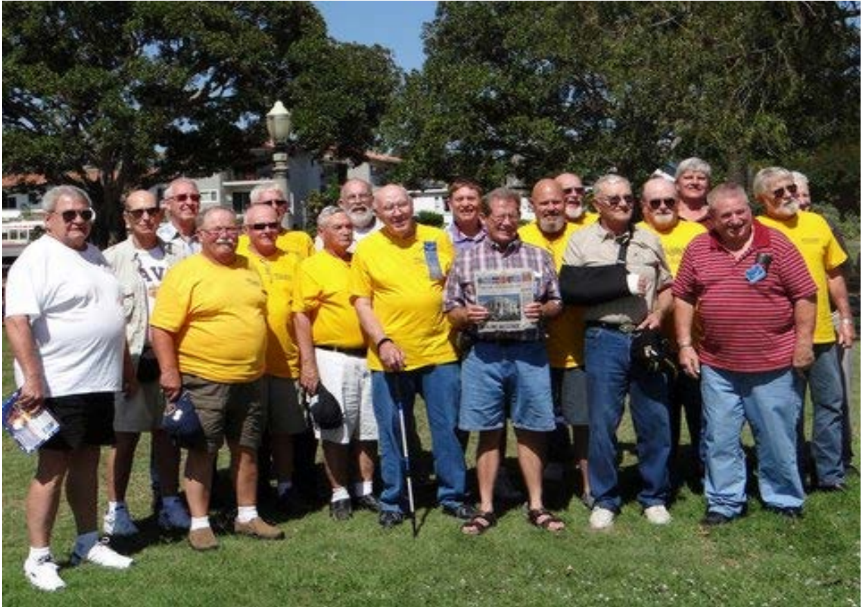
2016 Long Beach reunion sailors in Pt Fermin park.

More information about the reunion and agenda will be sent in the next newsletter.