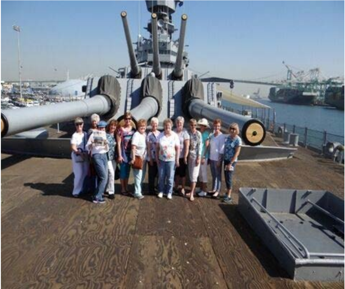
2016 long Beach reunion women on the USS Iowa