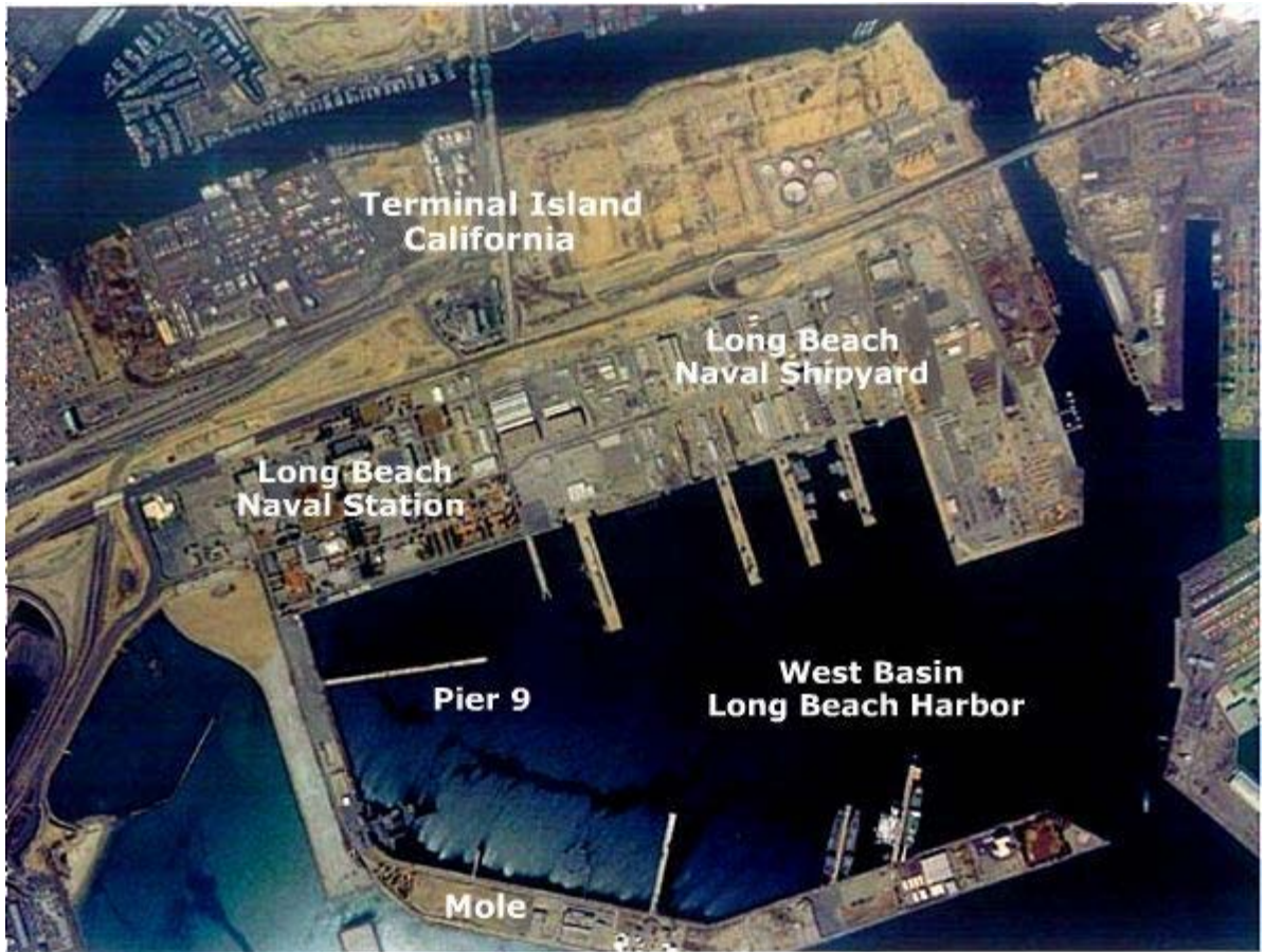
Pier 9 is where the T tied up.