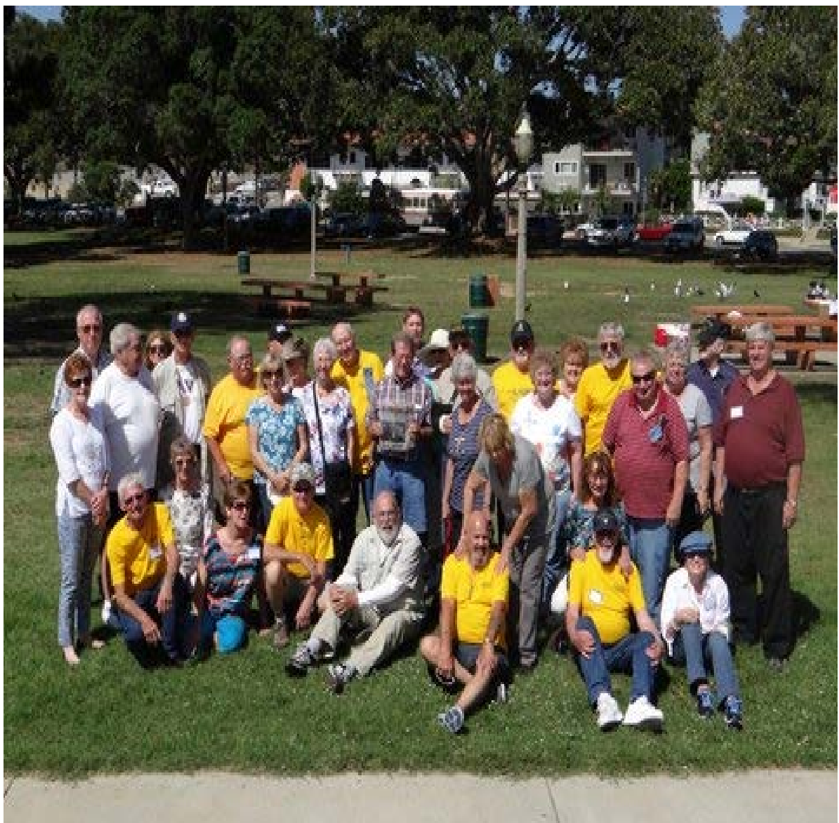
2016 Long Beach reunion group